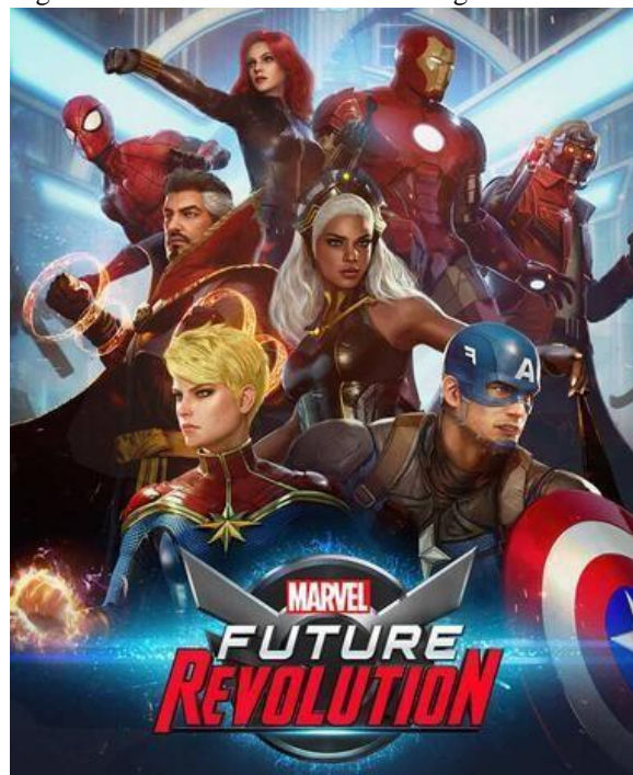
Fig. 2. Cover image of MARVEL Future Revolution game in RPG format for mobile

The image below represents the dissemination of the game on the main platforms for download, where you can observe the visual similarity not only of the movies but also of the games available for console, thus generating a visual identity standard for Marvel's interactive content.