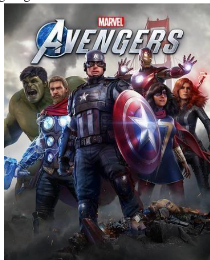
Fig. 2. Marvel's Avengers game 2020 cover taken from the official promotion website

The game's setting is very similar to the Avengers movie, including conical characters, villains and locations similar to movie scenes, which makes the experience very close to the cinema. The interactivity revolves around the use of players to unlock powerful, heroic skills and even unique equipment for each of the characters - heroes. This first version can be played by up to four participants and has regular updates for usability improvements. [15] The image below shows the version of the video game Marvel's Avengers, where you can see the characterizations of the characters identical to those of the movie and comic books.